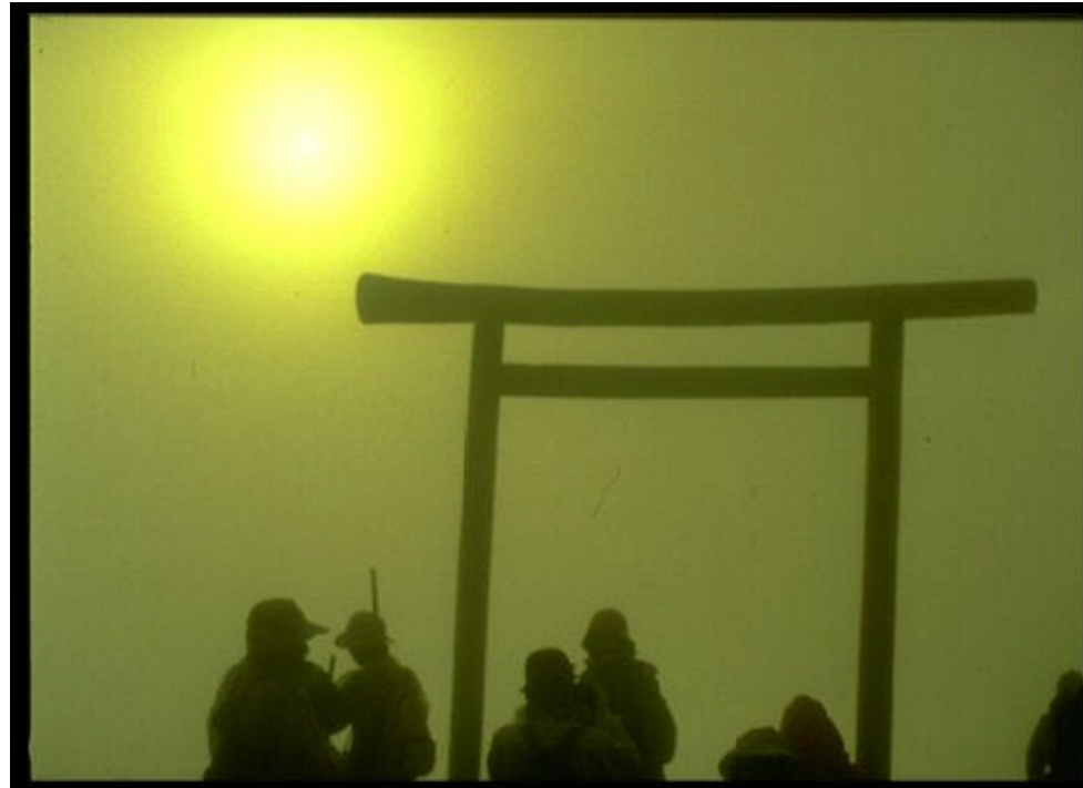
Top of Fuji-san